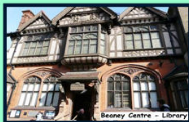
← / The Beaney