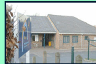
Thanington Neighbourhood Resource Centre