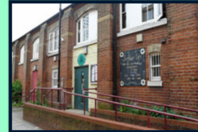
Northgate Ward Community Centre