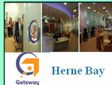
Herne Bay Gateway